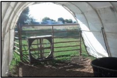
A canvas shelter and fan

The pond is tested and sprayed for mosquitos through the summer and is generally drained by late November. “Mosquito eating fish” are added to the pond annually for insect control. Diatomaceous earth is periodically added to manure piles. Fly traps (four different types, seven total) are placed around the property annually Spring through Fall and 3 new blacklight bug zappers have been recently added at locations near the llama shelters, replacing a single old zapper located near the house. Landowner reported conditions are that during seasonal warm weather mosquitoes are very rarely observed but the culicoides midges are frequently observed and bothersome to the llamas.