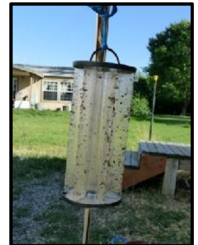
1 of 2 biting fly traps

their pasture in the summer and the supplement and hay through the winter months. Each llama is vaccinated for Clostridium C, D and Tetani annually. Each llama is occasionally treated with ENDURE pyrethroid fly spray during the summer and fall, mainly in the ears where biting flies congregate. Most llamas present on the property in the early Spring were treated with Cylence pyrethroid pour-on for treatment of lice at shearing time.