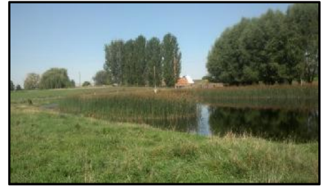
The pumper pond

20 llamas, 3 dogs, 3 cats and numerous chickens were on the property. The dogs, cats and chickens had free run of the property. The llamas are divided based on gender between the pastures. The females (13/20) are in the pasture with the pond. The males (1/20 intact, 5/20 gelded) were in the adjoining pasture. The first deceased gelded male resided in this pasture. A male (1/20 intact) had a small pasture to himself adjacent to the other males’ pasture. The second deceased gelded male also resided in this pasture. The third deceased intact male resided in a small pasture to himself adjacent to the females.