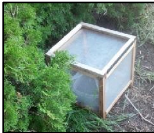
1 of 2 ground insect traps