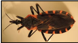
Triatoma sanguisuga ,

The vector-borne protozoan parasite Trypanosoma cruzi causes Chagas disease in humans and dogs. The nocturnal insect vector, commonly known as the kissing bug, can transmit the parasite to hosts by biting and subsequently defecating near the site of the bite. The parasites contained in the feces of the bug infect the dog via mucous membranes or breaks in the skin. Dogs can also acquire infection by eating infected bugs. Congenital transmission is also possible.